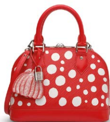
3893 A LIMITED EDITION RED & WHITE EPI LEATHER ALMA BB WITH SILVER HARDWARE BY YAYOI KUSAMA