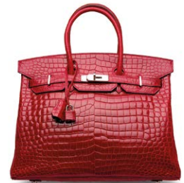
3898 A SHINY BRAISE POROSUS CROCODILE BIRKIN 35 WITH PALLADIUM HARDWARE

GRADE 1 HK$180,000-260,000 US$24,000-33,000