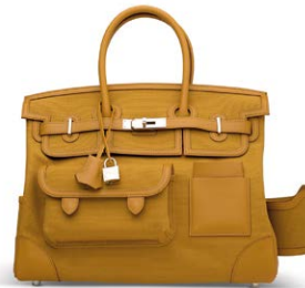
3875 A LIMITED EDITION DESERT CANVAS & SESAME SWIFT LEATHER CARGO BIRKIN 35 WITH PALLADIUM HARDWARE

GRADE 1 HK$100,000-160,000 US$13,000-21,000