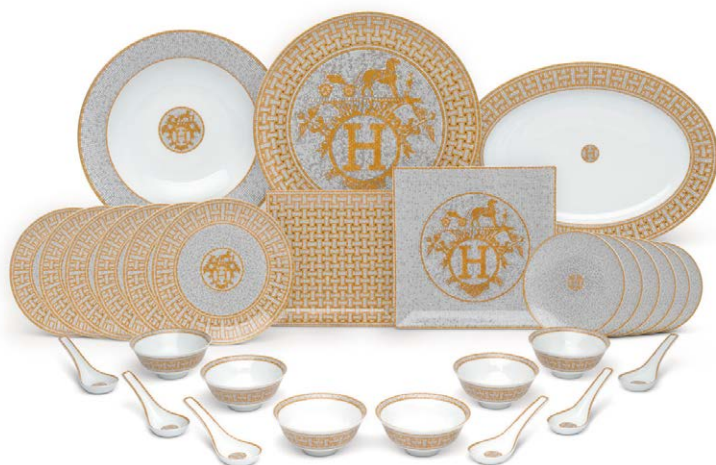
3995 A SET OF TWENTY NINE: MOSAÏQUE AU 24 GOLD PORCELAIN SET