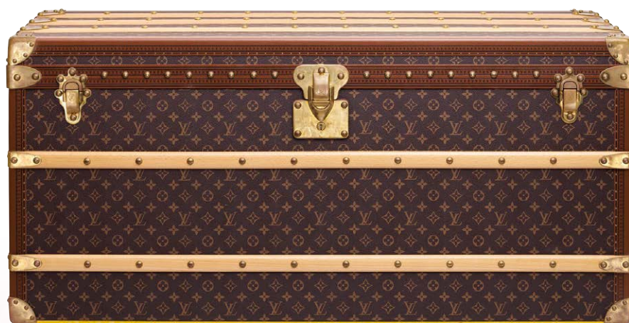
-3992 A COURRIER MONOGRAM TRUNK

GRADE 2 HK$60,000-100,000 US$7,800-13,000 110 w x 48 h x 55 d cm