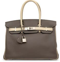
3907 A CUSTOM ÉTAIN & CRAIE SWIFT LEATHER BIRKIN 30 WITH BRUSHED PALLADIUM HARDWARE

GRADE 1 HK$70,000-110,000 US$9,000-14,000