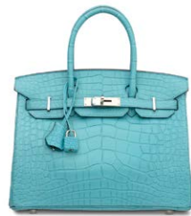
--3962 A MATTE BLEU SAINT CYR ALLIGATOR BIRKIN 30 WITH PALLADIUM HARDWARE

GRADE 2 HK$220,000-300,000 US$29,000-39,000