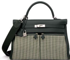
3976 A LIMITED EDITION VERT ANGLAIS SWIFT LEATHER & TOILE RIGA KELLY LAKIS 35 WITH PALLADIUM HARDWARE

GRADE 2 HK$70,000-110,000 US$9,000-14,000