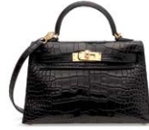
--3919 A MATTE BLACK ALLIGATOR MINI KELLY 20 II WITH GOLD HARDWARE

GRADE 1 HK$260,000-340,000 US$34,000-44,000