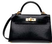
--3918 A SHINY BLACK NILOTICUS LIZARD MINI KELLY 20 II WITH GOLD HARDWARE

GRADE 1 HK$120,000-180,000 US$16,000-23,000