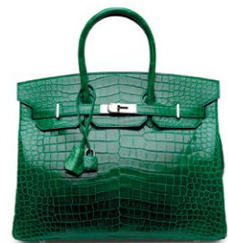
3973 A SHINY VERT ÉMERAUDE POROSUS CROCODILE BIRKIN 35 WITH PALLADIUM HARDWARE

GRADE 1 HK$200,000-280,000 US$26,000-36,000