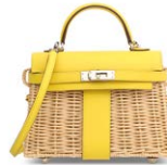
3844 A LIMITED EDITION JAUNE DE NAPLES SWIFT LEATHER & OSIER MINI PICNIC KELLY WITH PALLADIUM HARDWARE

GRADE 1.5 HK$240,000-320,000 US$31,000-41,000