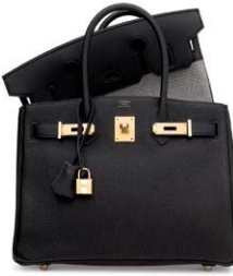
3932 A LIMITED EDITION BLACK TOGO & SWIFT LEATHER 3 IN 1 BIRKIN 30 WITH GOLD HARDWARE

GRADE 1 HK$180,000-260,000 US$24,000-33,000