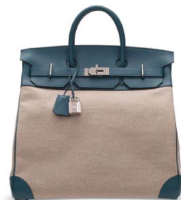
3944 A COLVERT EVERCOLOR LEATHER & FICELLE TOILE DE CAMP HAC BIRKIN 40 WITH PALLADIUM HARDWARE

GRADE 2 HK$60,000-100,000 US$7,800-13,000