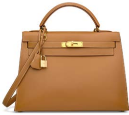
3873 A NATURAL CHAMONIX LEATHER SELLIER KELLY 32 WITH GOLD HARDWARE

GRADE 2.5 HK$40,000-60,000 US$5,200-7,700