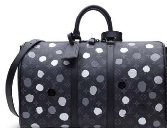
3892 A LIMITED EDITION MONOGRAM ECLIPSE CANVAS KEEPALL 45 WITH BLACK HARDWARE BY YAYOI KUSAMA