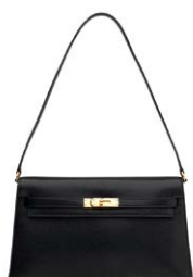
3915 A BLACK CHAMKILA CHÈVRE LEATHER KELLY ÉLAN WITH GOLD HARDWARE

GRADE 1 HK$80,000-120,000 US$11,000-15,000