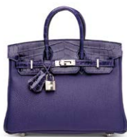
--3955 A LIMITED EDITION SHINY BLEU ENCRE NILOTICUS CROCODILE & TOGO LEATHER TOUCH BIRKIN 25 WITH PALLADIUM HARDWARE

GRADE 1 HK$380,000-550,000 US$49,000-71,000