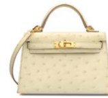
3830 A BÉTON OSTRICH MINI KELLY 20 II WITH GOLD HARDWARE

GRADE 1 HK$200,000-280,000 US$26,000-36,000