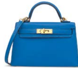
3964 A BLEU HYDRA CHÈVRE LEATHER MINI KELLY 20 II WITH GOLD HARDWARE

GRADE 1 HK$120,000-180,000 US$16,000-23,000