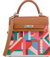
3878 A RARE, FAUVE BARÉNIA LEATHER & BEECHWOOD PERSPECTIVE CAVALIÈRE KELLY WOOD 22 WITH PALLADIUM HARDWARE

GRADE 1 HK$600,000-800,000 US$78,000-100,000