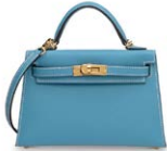
3963 A NEW BLEU JEAN EPSOM LEATHER MINI KELLY 20 II WITH GOLD HARDWARE

GRADE 1.5 HK$300,000-400,000 US$39,000-51,000