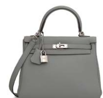
3854 A GRIS MOUETTE TOGO LEATHER RETOURNÉ KELLY 25 WITH PALLADIUM HARDWARE

GRADE 1 HK$120,000-180,000 US$16,000-23,000