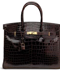
3821 A SHINY HAVANE POROSUS CROCODILE BIRKIN 35 WITH GOLD HARDWARE

GRADE 1 HK$240,000-320,000 US$31,000-41,000