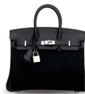
3928 A LIMITED EDITION BLACK SWIFT LEATHER & TUFFETAGE CÔTE À CÔTE BIRKIN 25 WITH PALLADIUM HARDWARE

GRADE 1 HK$120,000-180,000 US$16,000-23,000