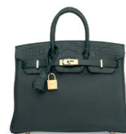
--3979 A LIMITED EDITION MATTE VERT CYPRÈS ALLIGATOR & TOGO LEATHER TOUCH BIRKIN 25 WITH GOLD HARDWARE

GRADE 2 HK$70,000-110,000 US$9,000-14,000