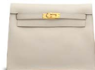
3851 A GRIS PERLE EVERCOLOR LEATHER KELLY DANSE WITH GOLD HARDWARE

GRADE 1 HK$320,000-420,000 US$42,000-54,000