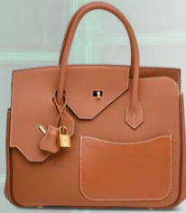
3812 A LIMITED EDITION GOLD TOGO, SWIFT LEATHER & FAUVE VACHE HUNTER DESORDRE BIRKIN 30 WITH GOLD HARDWARE

GRADE 1 HK$240,000-320,000 US$31,000-41,000