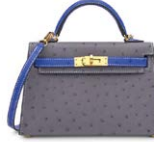
3857 A CUSTOM GRAPHITE & BLEUÉT OSTRICH MINI KELLY 20 II WITH GOLD HARDWARE

GRADE 1 HK$400,000-500,000 US$52,000-64,000