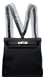
3937 A BLACK CLÉMENCE LEATHER KELLY ADO 22 WITH PALLADIUM HARDWARE

GRADE 1 HK$50,000-80,000 US$6,500-10,000