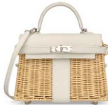
3824 A LIMITED EDITION WHITE SWIFT LEATHER & OSIER MINI PICNIC KELLY WITH PALLADIUM HARDWARE

GRADE 1.5 HK$240,000-320,000 US$31,000-41,000