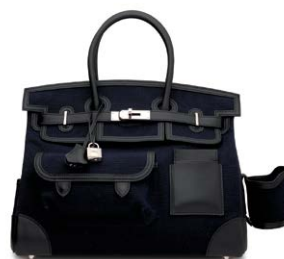
3953 A LIMITED EDITION BLEU MARINE CANVAS & BLACK SWIFT LEATHER CARGO BIRKIN 35 WITH PALLADIUM HARDWARE

GRADE 1 HK$100,000-160,000 US$13,000-21,000