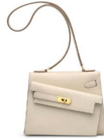
3828 A LIMITED EDITION CRAIE EPSOM LEATHER MINI DESORDRE KELLY 20 WITH GOLD HARDWARE

GRADE 1 HK$200,000-280,000 US$26,000-36,000