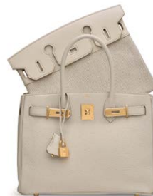
3829 A LIMITED EDITION BÉTON TOGO & SWIFT LEATHER 3 IN 1 BIRKIN 30 WITH GOLD HARDWARE

GRADE 2 HK$70,000-110,000 US$9,000-14,000