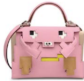
3880 A LIMITED EDITION MAUVE SYLVESTRE, CHAI, LIME & NATA EPSOM LEATHER KELLYDOLE PICTO WITH PALLADIUM HARDWARE

GRADE 1 HK$350,000-450,000 US$45,000-58,000