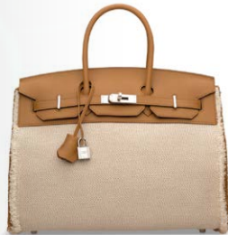
3868 A LIMITED EDITION SESAME SWIFT LEATHER & TWILL H CANVAS FRAY FRAY BIRKIN 35 WITH PALLADIUM HARDWARE

GRADE 2.5 HK$80,000-120,000 US$11,000-15,000