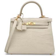
--3832 A MATTE BÉTON ALLIGATOR RETOURNÉ KELLY 25 WITH GOLD HARDWARE

GRADE 1.5 HK$1,000,000-1,800,000 US$130,000-230,000