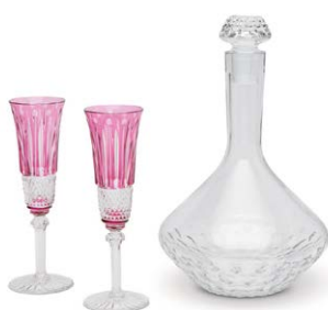
3997 A SET OF THREE: ST. LOUIS CRYSTAL DECANTER & CHAMPAGNE FLUTES

round place: diameter 21 cm tea pot: capacity: 140 cl tea cup: capacity: 20 cl sugar bowl: capacity 21 cl creamer: capacity: 15 cl rectangular tray: 16 w x 12 h cm soy dish: diameter 10 cm