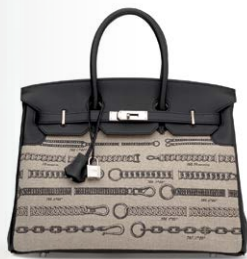
3939 A LIMITED EDITION TOILE DE CAMP DÉCHAINÉE & BLACK SWIFT LEATHER BIRKIN 35 WITH PALLADIUM HARDWARE

GRADE 1.5 HK$220,000-300,000 US$29,000-39,000