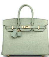
--3968 A MATTE VERT D'EAU ALLIGATOR BIRKIN 25 WITH GOLD HARDWARE

GRADE 1.5 HK$80,000-120,000 US$11,000-15,000