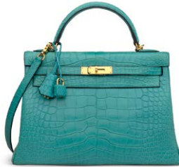
3959 3959 A MATTE BLEU PAON ALLIGATOR RETOURNÉ KELLY 32 WITH GOLD HARDWARE

GRADE 1 HK$80,000-120,000 US$11,000-15,000