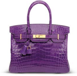
--3888 A SHINY ULTRAVIOLET NILOTICUS CROCODILE BIRKIN 30 WITH GOLD HARDWARE

GRADE 2 HK$220,000-300,000 US$29,000-39,000