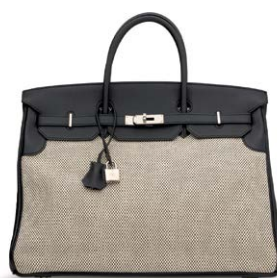
3943 A LIMITED EDITION BLACK SWIFT LEATHER & ÉCRU TOILE CRISS CROSS BIRKIN 40 WITH PALLADIUM HARDWARE

GRADE 2 HK$50,000-80,000 US$6,500-10,000