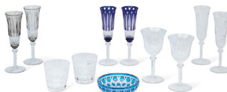
3998 A SET OF ELEVEN: ST. LOUIS CRYSTAL PLATE & GLASSES

Decanter: 20cm diameter x 30 h cm Champagne flute: 7 cm diameter x 20 h cm