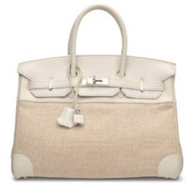
3827 A LIMITED EDITION WHITE SWIFT LEATHER & CANVAS BIRKIN 35 WITH PALLADIUM HARDWARE

GRADE 1.5 HK$200,000-280,000 US$26,000-36,000