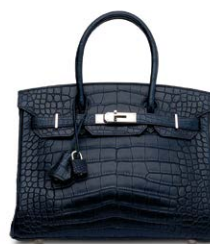
--3952 A MATTE BLEU MARINE ALLIGATOR BIRKIN 30 WITH PALLADIUM HARDWARE

GRADE 1 HK$100,000-160,000 US$13,000-21,000