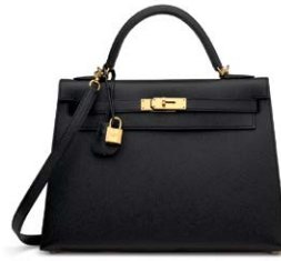
3923 A BLACK EPSOM LEATHER SELLIER KELLY 32 WITH GOLD HARDWARE

GRADE 2 HK$50,000-80,000 US$6,500-10,000