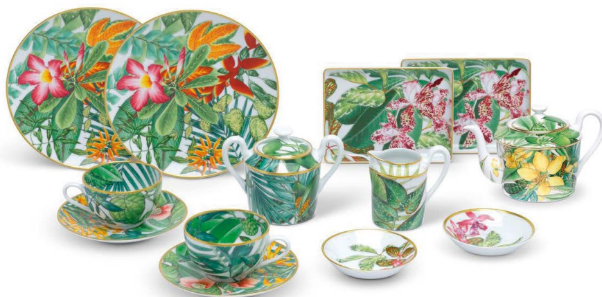
3996 A SET OF ELEVEN PORCELAIN: PASSIFOLIA TEA POT, TEA CUPS & PLATES

Big oval plate x 1: 42 w x 30 h cm Presentation plate x 1: diameter 32 cm Round soup plate x 1: 29 cm Bowls x 6: diameter 11.5 cm Small round plate x 6: diameter 16 cm Dessert plate x 6: diameter 21 cm Big square plate x 1: 23 w x 23 h cm Small square plate x 1: 19.5 w x 19.5 h cm Spoon x 6: length: 14 cm