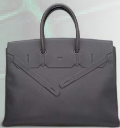
3858 A RARE, ARDOISE EVERCALF LEATHER SHADOW BIRKIN 35 WITH PALLADIUM HARDWARE

GRADE 1 HK$100,000-160,000 US$13,000-21,000