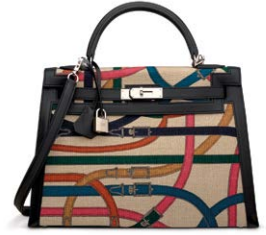
3940 A LIMITED EDITION TOILE DE CAMP CAVALCADOUR & BLACK SWIFT LEATHER SELLIER KELLY 32 WITH PALLADIUM HARDWARE

GRADE 2 HK$60,000-100,000 US$7,800-13,000