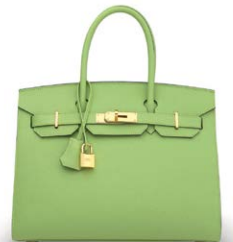
3969 A VERT CRIQUET EPSOM LEATHER SELLIER BIRKIN 30 WITH GOLD HARDWARE

GRADE 1.5 HK$240,000-320,000 US$31,000-41,000