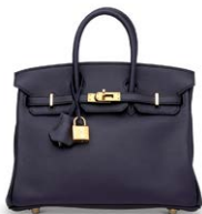
3956 A BLEU INDIGO SWIFT LEATHER BIRKIN 25 WITH GOLD HARDWARE

GRADE 1.5 HK$180,000-260,000 US$24,000-33,000