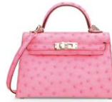
3807 A ROSE BUBBLEGUM OSTRICH MINI KELLY 20 II WITH PALLADIUM HARDWARE

GRADE 1 HK$200,000-300,000 US$26,000-39,000