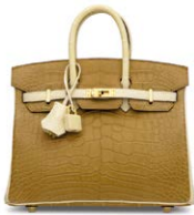
--3867 A CUSTOM MATTE KRAFT & VANILLE ALLIGATOR BIRKIN 25 WITH BRUSHED GOLD HARDWARE

GRADE 1 HK$420,000-520,000 US$54,000-67,000