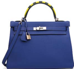
3946 A LIMITED EDITION BLEU ÉLECTRIQUE TOGO LEATHER RETOURNÉ AU GALOP KELLY 32 WITH PALLADIUM HARDWARE

GRADE 1 HK$80,000-120,000 US$11,000-15,000