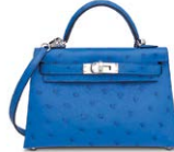
3965 A BLEUET OSTRICH MINI KELLY 20 II WITH PALLADIUM HARDWARE

GRADE 2 HK$80,000-120,000 US$11,000-15,000