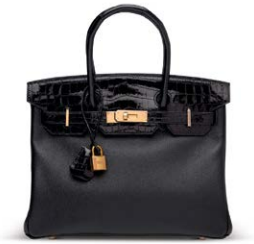
--3929 A LIMITED EDITION SHINY BLACK NILOTICUS CROCODILE & NOVILLO LEATHER TOUCH BIRKIN 30 WITH ROSE GOLD HARDWARE

GRADE 2 HK$80,000-120,000 US$11,000-15,000