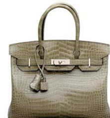
--3861 A SHINY GRIS TOURTERELLE POROSUS CROCODILE BIRKIN 30 WITH PALLADIUM HARDWARE

GRADE 1 HK$100,000-160,000 US$13,000-21,000