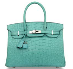
--3960 A MATTE BLEU PAON ALLIGATOR BIRKIN 30 WITH PALLADIUM HARDWARE

GRADE 1 HK$180,000-260,000 US$24,000-33,000