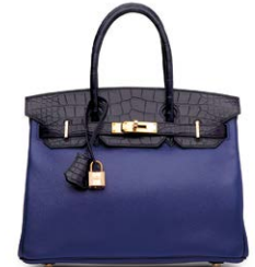
--3954 A LIMITED EDITION MATTE BLEU MARINE ALLIGATOR & BLEU SAPHIR NOVILLO LEATHER TOUCH BIRKIN 30 WITH ROSE GOLD HARDWARE

GRADE 1.5 HK$300,000-400,000 US$39,000-51,000