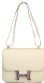
3825 A LIMITED EDITION WHITE EVERCOLOR LEATHER OPTIQUE CONSTANCE 24 WITH ENAMEL & PALLADIUM HARDWARE

GRADE 2.5 HK$140,000-200,000 US$18,000-26,000