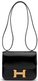
3912 A BLACK CALF BOX LEATHER MINI CONSTANCE 18 WITH GOLD HARDWARE

GRADE 1 HK$70,000-110,000 US$9,000-14,000