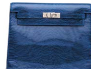
--3948 A SHINY BLEU SAPHIR NILOTICUS LIZARD KELLY DANSE WITH PALLADIUM HARDWARE

GRADE 1 HK$70,000-110,000 US$9,000-14,000