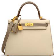
3837 A CUSTOM NATA & GRIS ASPHALTE EPSOM LEATHER SELLIER KELLY 25 WITH BRUSHED GOLD HARDWARE

GRADE 1 HK$120,000-180,000 US$16,000-23,000