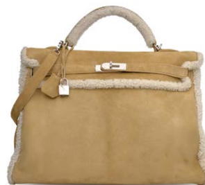
3814 A RARE, VEAU DOBLIS & MOUTON SHEARLING TEDDY KELLY 40 WITH PALLADIUM HARDWARE

GRADE 2 HK$100,000-160,000 US$13,000-21,000