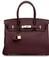
3899 A BORDEAUX TOGO LEATHER BIRKIN 30 WITH GOLD HARDWARE

GRADE 1 HK$240,000-320,000 US$31,000-41,000