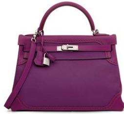
3887 A LIMITED EDITION ANÉMONE TOGO & SWIFT LEATHER RETOURNÉ GHILLIES KELLY 32 WITH PALLADIUM HARDWARE

GRADE 2.5 HK$40,000-60,000 US$5,200-7,700