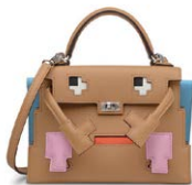
3871 A LIMITED EDITION CHAI, MAUVE SYLVESTRE, TERRE BATTUE & CÉLESTE EPSOM LEATHER KELLYDOLE PICTO WITH PALLADIUM HARDWARE

GRADE 1 HK$1,000,000-2,000,000 US$130,000-260,000