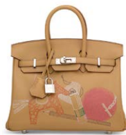
3870 A LIMITED EDITION BISCUIT SWIFT LEATHER IN & OUT BIRKIN 25 WITH PALLADIUM HARDWARE

GRADE 1 HK$420,000-520,000 US$54,000-67,000