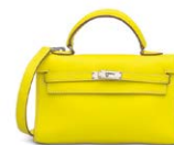
3845 A LIMITED EDITION LIME EPSOM LEATHER MICRO MINI KELLY WITH PALLADIUM HARDWARE

GRADE 1 HK$60,000-100,000 US$7,800-13,000