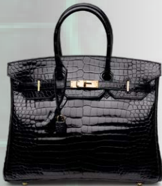
3933 A SHINY BLACK POROSUS CROCODILE BIRKIN 35 WITH GOLD HARDWARE

GRADE 1.5 HK$220,000-300,000 US$29,000-39,000