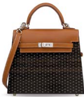
3819 A RARE, FAUVE BARÉNIA LEATHER & BOG OAK KELLY WOOD 22 WITH PALLADIUM HARDWARE

GRADE 1 HK$600,000-800,000 US$78,000-100,000