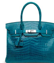
--3966 A SHINY BLEU IZMIR POROSUS CROCODILE BIRKIN 30 WITH PALLADIUM HARDWARE

GRADE 1 HK$300,000-380,000 US$39,000-49,000