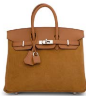
3872 A LIMITED EDITION CHAMOIS VEAU GRIZZLY LEATHER & GOLD SWIFT LEATHER BIRKIN 25 WITH PALLADIUM HARDWARE

GRADE 1 HK$140,000-200,000 US$18,000-26,000