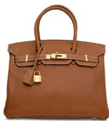
3817 A FAUVE BARÉNIA FAUBOURG LEATHER BIRKIN 30 WITH GOLD HARDWARE

GRADE 2 HK$70,000-110,000 US$9,000-14,000