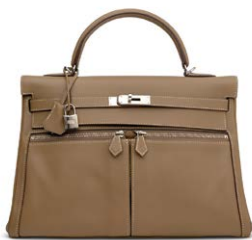
3904 A CUSTOM ÉTOUPE SWIFT LEATHER KELLY LAKIS 35 WITH PALLADIUM HARDWARE

GRADE 1 HK$50,000-80,000 US$6,500-10,000