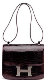
~#3900 A SHINY BORDEAUX POROSUS CROCODILE CONSTANCE 24 WITH PALLADIUM HARDWARE

GRADE 2 HK$60,000-100,000 US$7,800-13,000