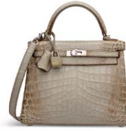
--3863 A RARE, MATTE GRIS CENDRÉ HIMALAYA NILOTICUS CROCODILE RETOURNÉ KELLY 25 WITH PALLADIUM HARDWARE

GRADE 1.5 HK$1,000,000-1,800,000 US$130,000-230,000