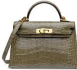
3860 A SHINY GRIS TOURTERELLE ALLIGATOR MINI KELLY 20 II WITH GOLD HARDWARE

GRADE 1 HK$200,000-280,000 US$26,000-36,000