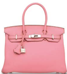
3805 A PINK 5P TOGO LEATHER BIRKIN 30 WITH PALLADIUM HARDWARE

GRADE 1 HK$180,000-260,000 US$24,000-33,000