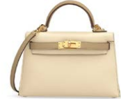
3836 A CUSTOM NATA & TRENCH EPSOM LEATHER MINI KELLY II 20 WITH GOLD HARDWARE

GRADE 1 HK$200,000-280,000 US$26,000-36,000