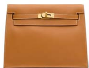
3810 A GOLD EVERCOLOR LEATHER KELLY DANSE WITH GOLD HARDWARE

GRADE 1 HK$70,000-110,000 US$9,000-14,000