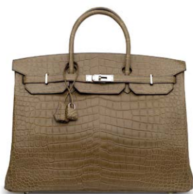
3908 A MATTE ORIGAN POROSUS CROCODILE BIRKIN 40 WITH PALLADIUM HARDWARE

GRADE 1.5 HK$200,000-280,000 US$26,000-36,000