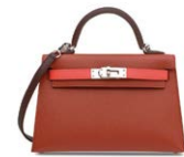
3894 A LIMITED EDITION ROUGE VENITIEN, ROSE TEXAS & ROUGE SELLIER EPSOM LEATHER MINI KELLY 20 II WITH PALLADIUM HARDWARE

GRADE 1 HK$400,000-500,000 US$52,000-64,000