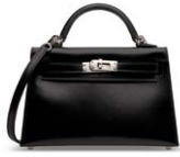
3917 A BLACK CALF BOX LEATHER MINI KELLY 20 II WITH PALLADIUM HARDWARE

GRADE 1 HK$120,000-180,000 US$16,000-23,000