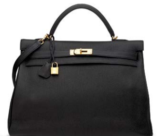
3942 A BLACK TOGO LEATHER RETOURNÉ KELLY 40 WITH GOLD HARDWARE

GRADE 2 HK$300,000-400,000 US$39,000-51,000