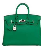
3972 A VERT VERTIGO SWIFT LEATHER BIRKIN 25 WITH PALLADIUM HARDWARE

GRADE 2 HK$260,000-340,000 US$34,000-44,000