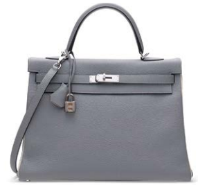
3855 A CUSTOM GRIS MOUETTE & CRAIE TOGO LEATHER RETOURNÉ KELLY 35 WITH PALLADIUM HARDWARE

GRADE 2 HK$70,000-110,000 US$9,000-14,000