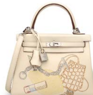
3839 A LIMITED EDITION NATA SWIFT LEATHER IN & OUT RETOURNÉ KELLY 25 WITH PALLADIUM HARDWARE

GRADE 1 HK$160,000-240,000 US$21,000-31,000