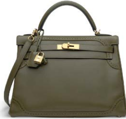
3977 A LIMITED EDITION VERT VERONÈSE TADELAKT LEATHER GHILLIES RETOURNÉ KELLY 32 WITH PERMABRASS HARDWARE

GRADE 2 HK$140,000-200,000 US$18,000-26,000