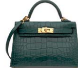
--3975 A MATTE VERT CYPRÈS ALLIGATOR MINI KELLY 20 II WITH GOLD HARDWARE

GRADE 1 HK$200,000-280,000 US$26,000-36,000