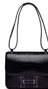
~#3935 A SHINY BLACK ALLIGATOR CONSTANCE 24 WITH BLEU ENAMEL & PALLADIUM HARDWARE

GRADE 1 HK$160,000-240,000 US$21,000-31,000