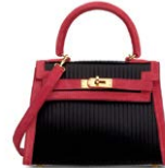
3920 A RARE, BLACK RIBBED SATIN & FUCHSIA VEAU DOBLIS MINI PLISSÉ KELLY 20 WITH GOLD HARDWARE

GRADE 1 HK$300,000-400,000 US$39,000-51,000