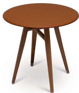
3993 A FAUVE TAURILLON H LEATHER & WALNUT WOOD LES NÉCESSAIRES D'HERMÈS SIMPLE TABLE