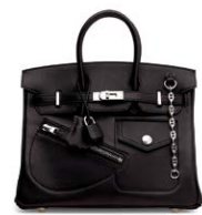
3931 A LIMITED EDITION BLACK VOLUPTO LEATHER ROCK BIRKIN 25 WITH PALLADIUM HARDWARE

GRADE 1 HK$120,000-180,000 US$16,000-23,000