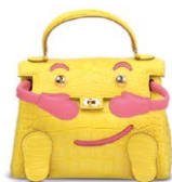
3848 A CUSTOM MATTE MIMOSA ALLIGATOR & ROSE AZALÉE SWIFT LEATHER QUELLE IDOLE WITH GOLD HARDWARE

GRADE 1 HK$1,000,000-2,000,000 US$130,000-260,000