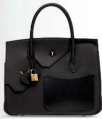
3930 A LIMITED EDITION BLACK TOGO & SWIFT LEATHER DESORDRE BIRKIN 30 WITH GOLD HARDWARE

GRADE 1 HK$240,000-320,000 US$31,000-41,000