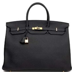
3941 A BLACK TOGO LEATHER BIRKIN 40 WITH GOLD HARDWARE

GRADE 1.5 HK$200,000-280,000 US$26,000-36,000