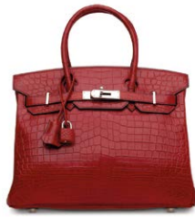
--3897 A MATTE ROUGE H NILOTICUS CROCODILE BIRKIN 30 WITH PALLADIUM HARDWARE

GRADE 2 HK$220,000-300,000 US$29,000-39,000