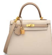
3840 A CUSTOM NATA & TRENCH EPSOM LEATHER SELLIER KELLY 25 WITH BRUSHED GOLD HARDWARE

GRADE 1 HK$180,000-260,000 US$24,000-33,000