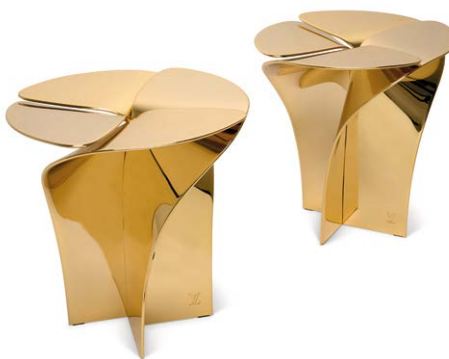
3994 A SET OF TWO: METALLIC GOLD CARBON FIBER BLOSSOM STOOLS BY TOKUJIN YOSHIOKA FOR LOUIS VUITTON