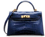
--3947 A SHINY BLEU SAPHIR ALLIGATOR MINI KELLY 20 II WITH GOLD HARDWARE

GRADE 1.5 HK$120,000-180,000 US$16,000-23,000