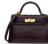
3890 A MATTE AMÉTHYSTE ALLIGATOR MINI KELLY 20 II WITH GOLD HARDWARE

GRADE 2 HK$200,000-280,000 US$26,000-36,000