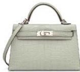
3853 A MATTE GRIS NÉVÉ ALLIGATOR MINI KELLY 20 II WITH PALLADIUM HARDWARE

GRADE 1 HK$160,000-240,000 US$21,000-31,000