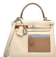
3838 A LIMITED EDITION NATA, CHAI, CUIVRE, LIME & MAUVE SYLVESTRE SWIFT LEATHER COLORMATIC RETOURNÉ KELLY 25 WITH PALLADIUM HARDWARE

GRADE 1 HK$120,000-180,000 US$16,000-23,000