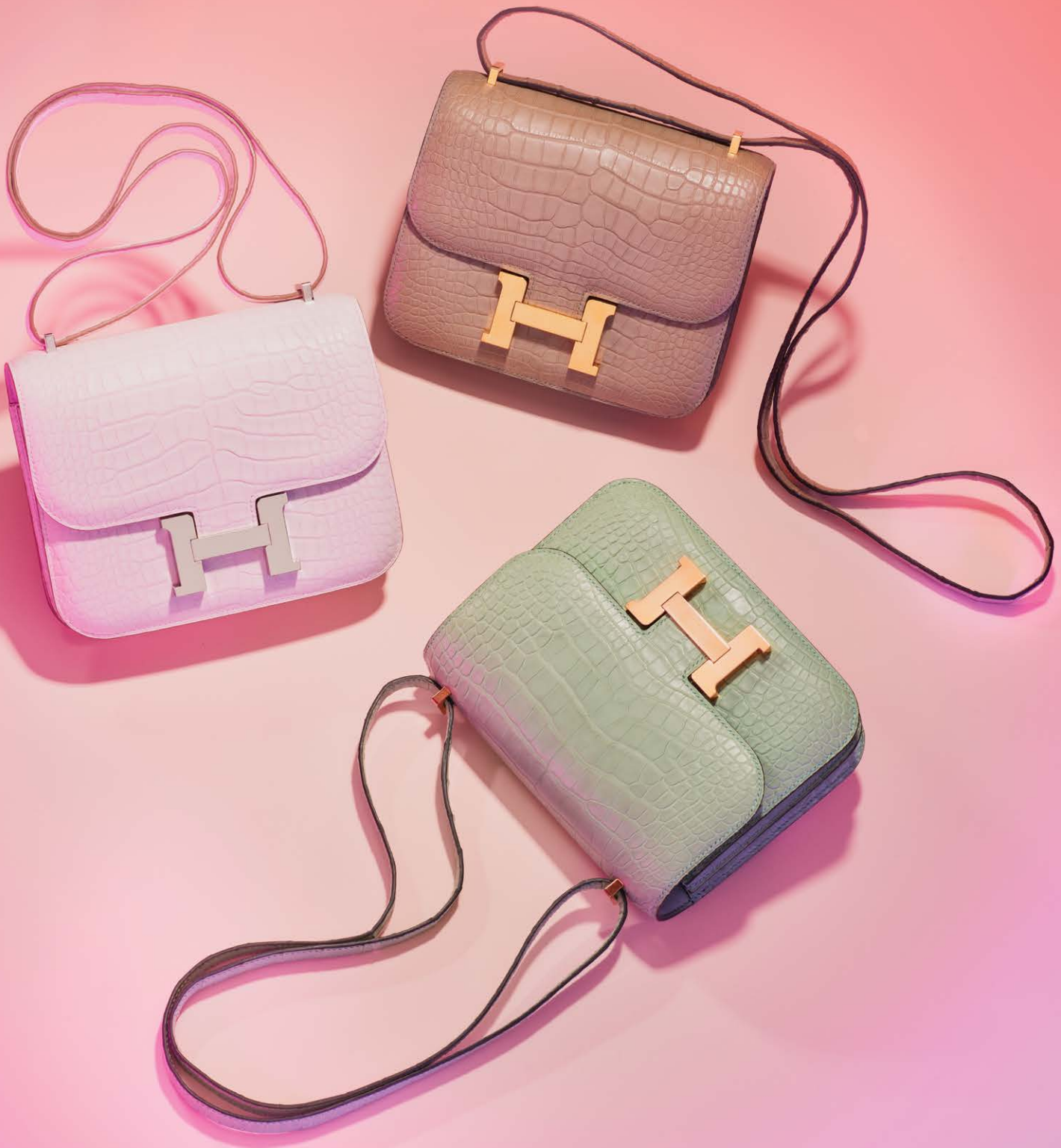
~#3859 A MATTE GRIS TOURTERELLE ALLIGATOR MINI CONSTANCE 18 WITH GOLD HARDWARE HERMÈS, 2017 GRADE: 2.5 HK$140,000-200,000 US$18,000-26,000 18 w x 15 h x 5 d cm