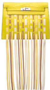
--3847 A RARE, CUSTOM MATTE LIME ALLIGATOR FRINGES KELLY DANSE WITH PALLADIUM HARDWARE

GRADE 1 HK$70,000-110,000 US$9,000-14,000